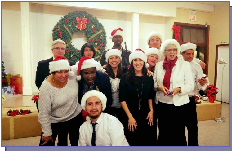
Staff and Volunteers at the Oasis Christmas Celebration

Significantly, community members, volunteers, staff and supporters of Oasis were able to mingle. Additional funds were raised.